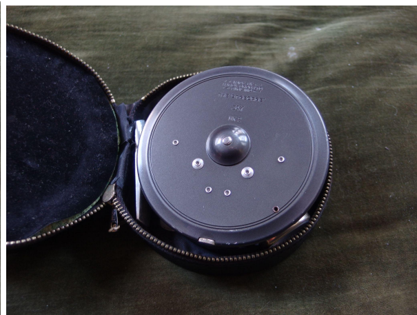
Sage 503L Made in england