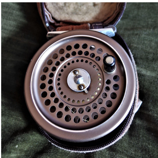
Sage 506 Made in england