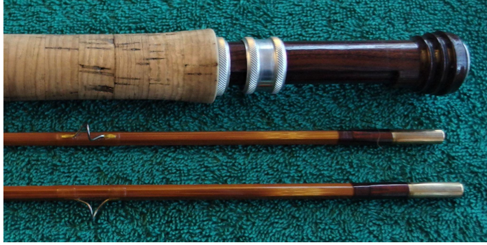
Sofkher 8ft 4wt 2pc 2tips Designed and made for Deke meyer inscribed on rod shaft