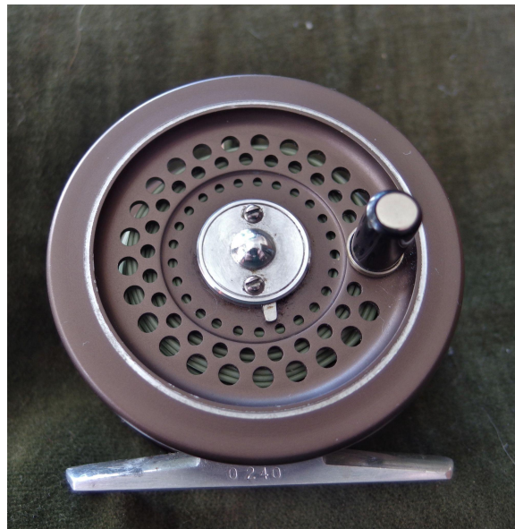
Sage 505L made in england