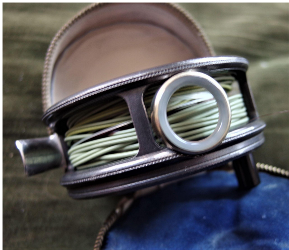
Hardy St. George 3 3/4 MK2